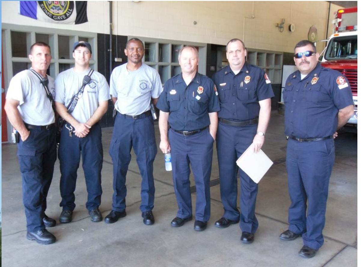
Firefighters from Fire Station #3